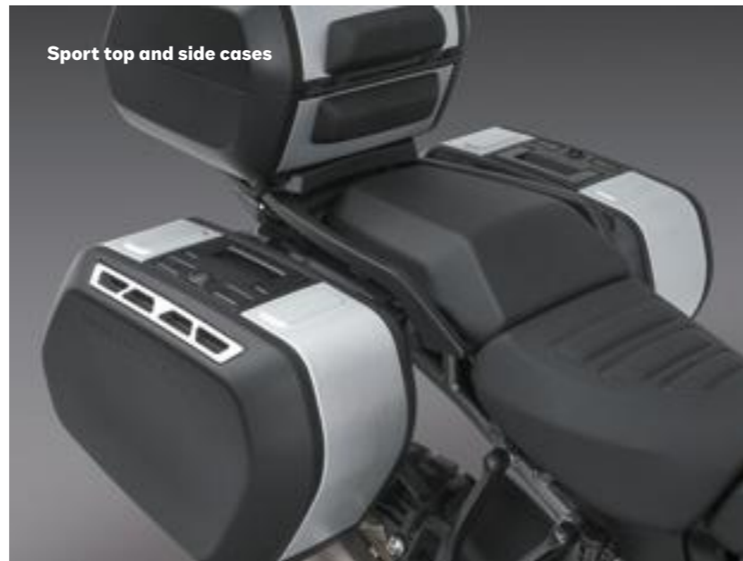
Sport top and side cases