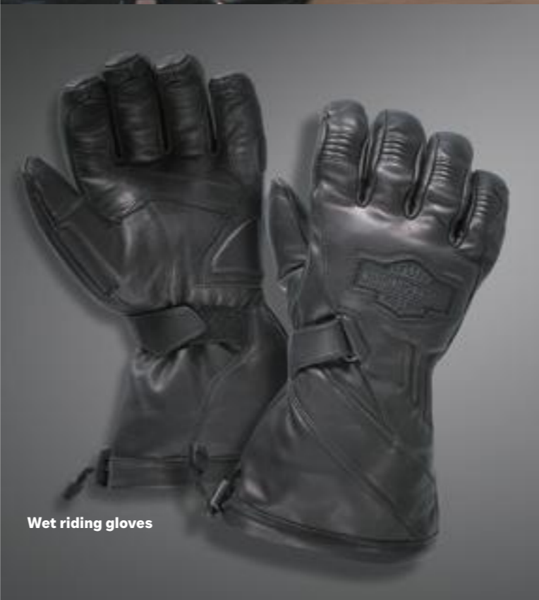
Wet riding gloves