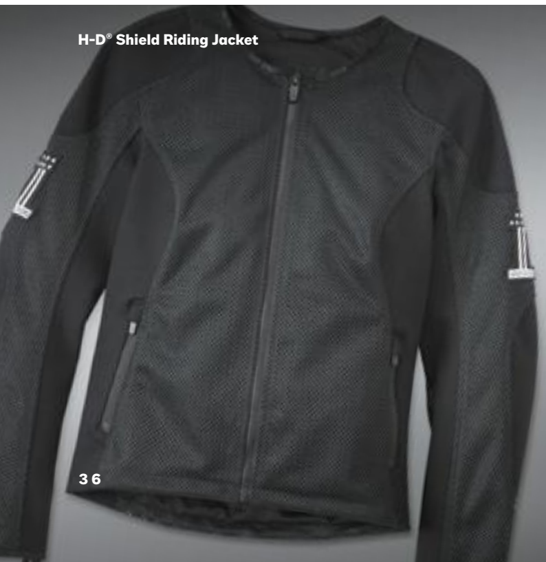
H-D® Shield Riding Jacket