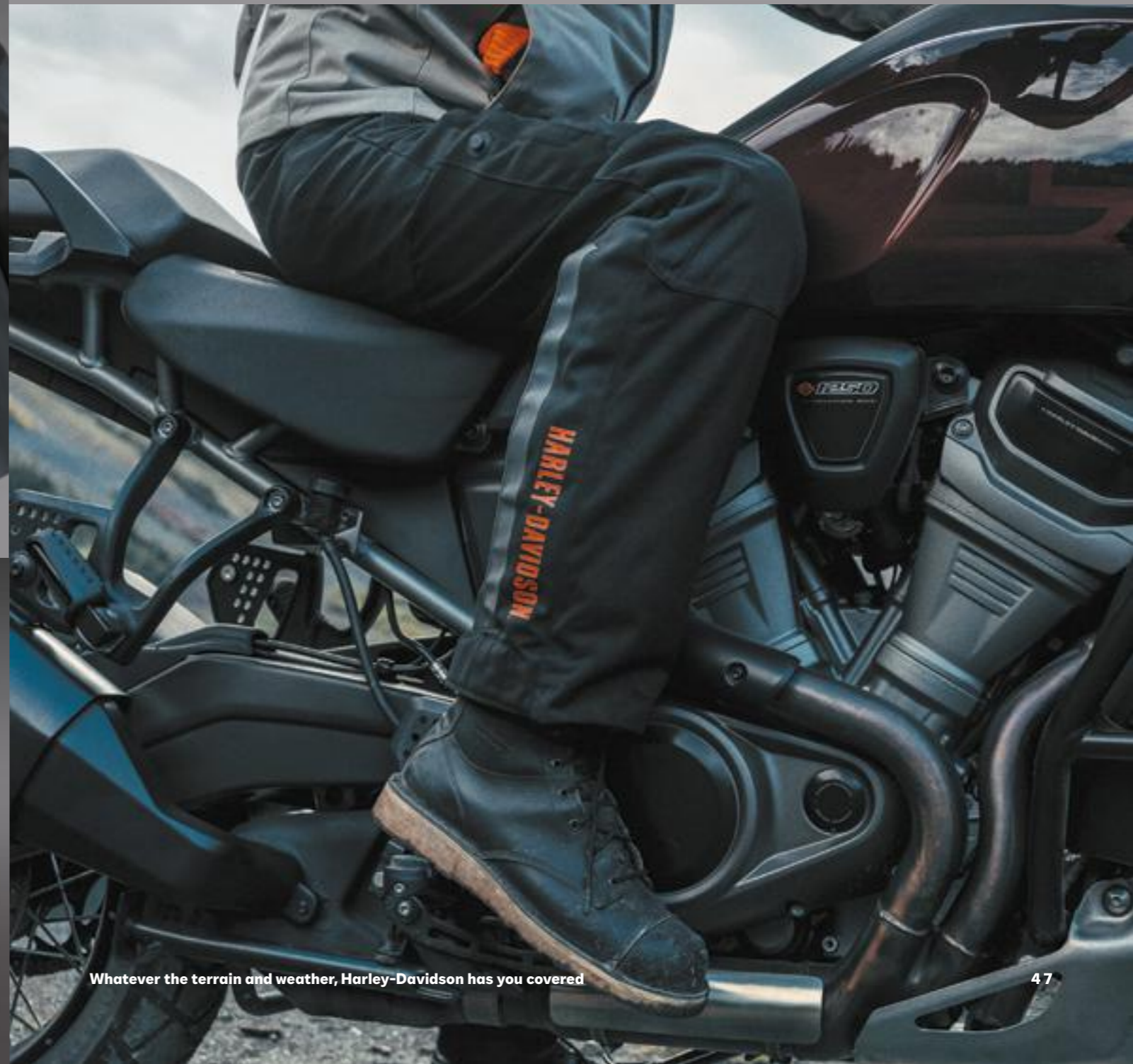
Whatever the terrain and weather, Harley-Davidson has you covered