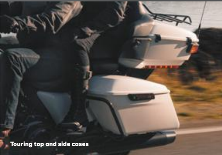
Touring top and side cases