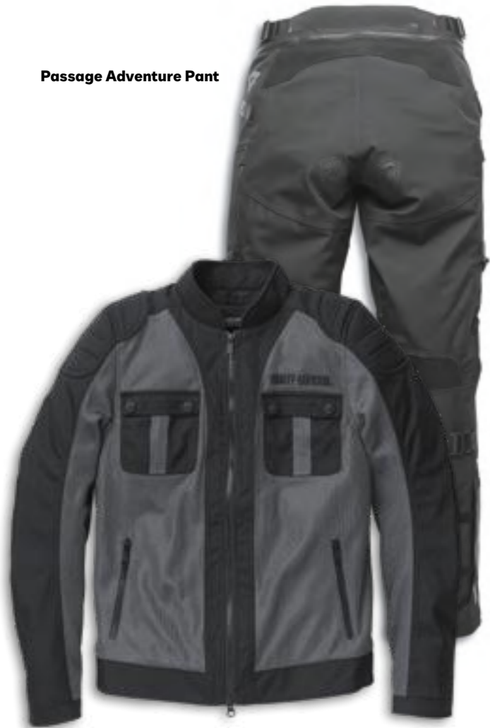
Passage Adventure Jacket