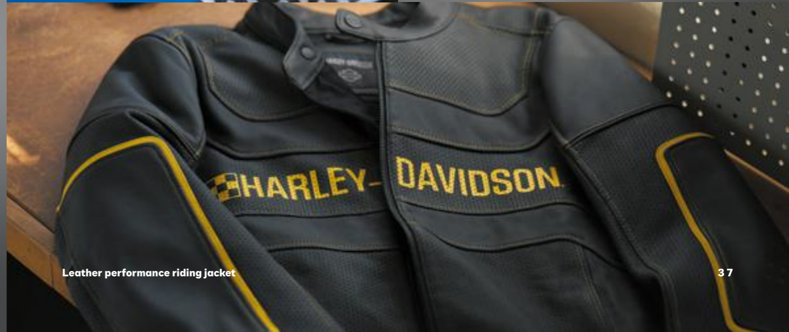
Leather performance riding jacket