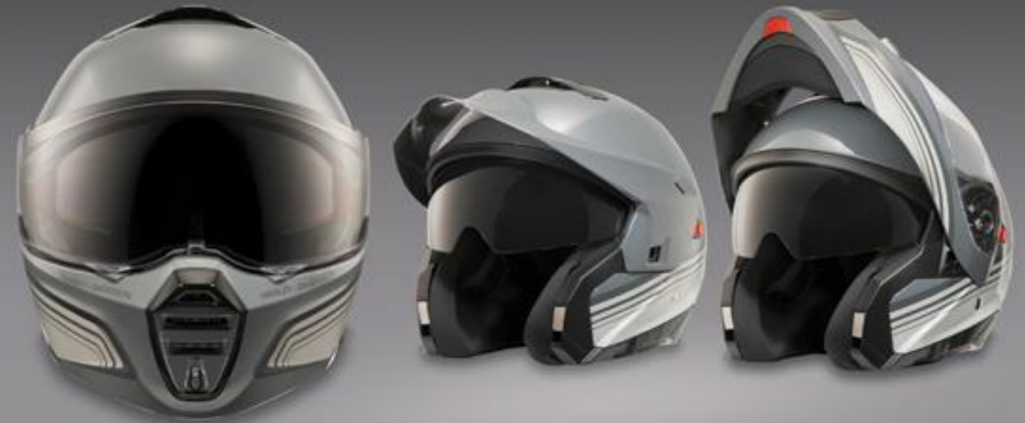
H-D® Evo X17 Sunshield Modular Helmet