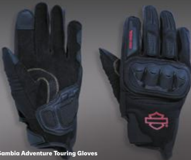
Sambia Adventure Touring Gloves