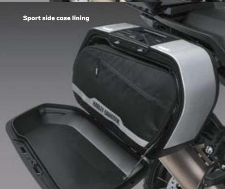
Sport side case lining