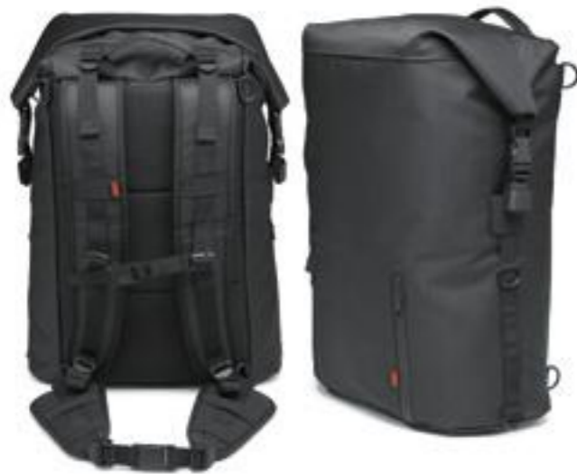
Overwatch Dry Backpack