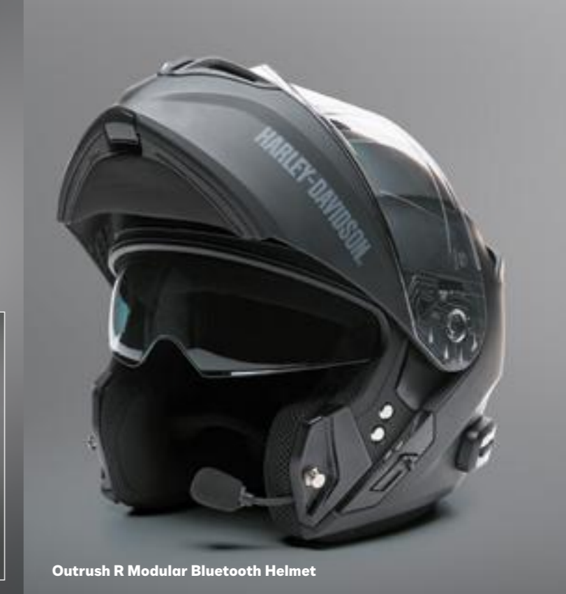
Outrush R Modular Bluetooth Helmet