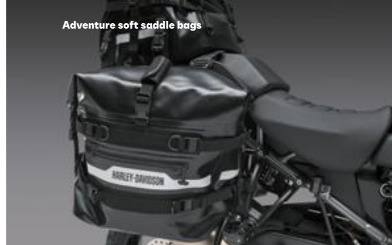
Adventure soft saddle bags