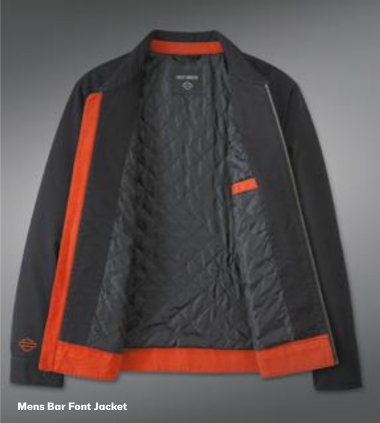
Mens Bar Font Jacket

H-D® Detachables Solo and Two-up Luggage Racks are just two mounting systems that add additional carrying surfaces to suit multiple luggage accessories. Protect everything with the Onyx Premium Luggage range, which fulfils all strap-on luggage needs from Touring Bag through to Tank Bag and even a Fly & Ride Bag for a fuss-free overseas Harley-Davidson® Authorized Tours.