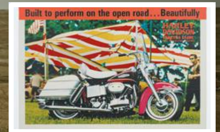
1968 poster advertising the Electra Glide®