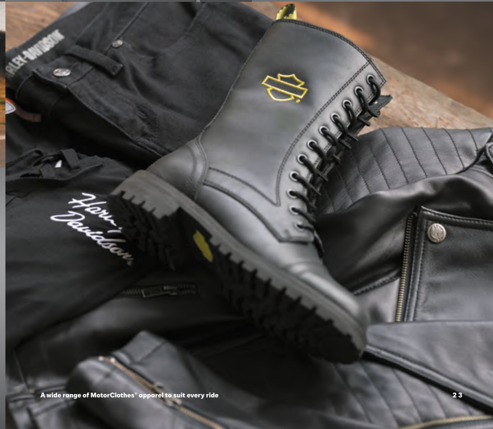
A wide range of MotorClothes® apparel to suit every ride