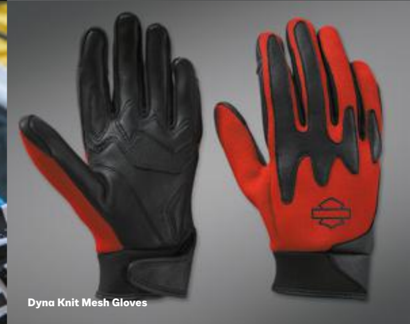
Dyna Knit Mesh Gloves