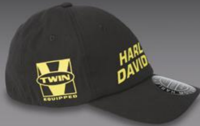
Willie G® Skull Viper Waxed Style Cap