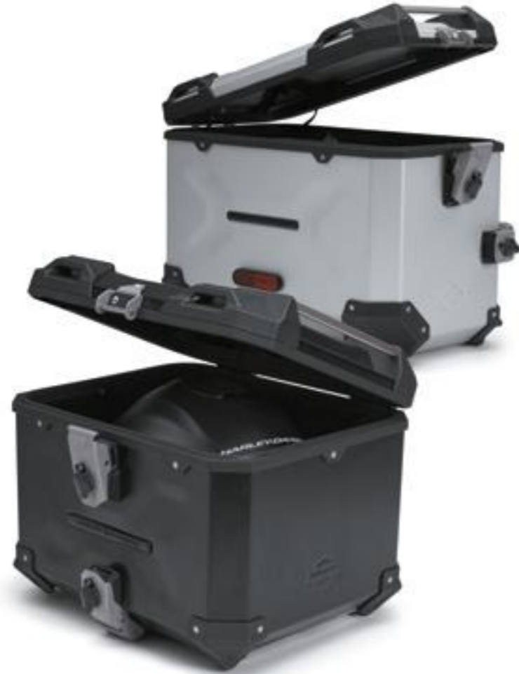
Lockable Top Case

The ultimate armour for trail blazers comes in aluminium. Created in collaboration with SW-MOTECH, the lockable Top Case and matching Side Cases, are available in Black or Silver trim, locked securely to the case mounting system. Sport and Soft Luggage versions are also available, along with an Overwatch Dry Backpack, Pan America™ specific Tank Bag and more. Check them all at your local Harley-Davidson® dealership.