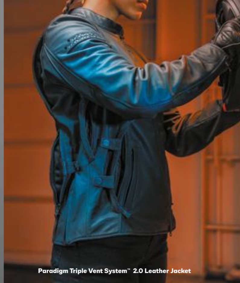
Paradigm Triple Vent System™ 2.0 Leather Jacket