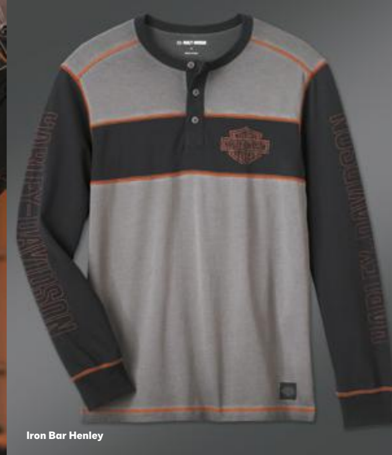
Iron Bar Henley