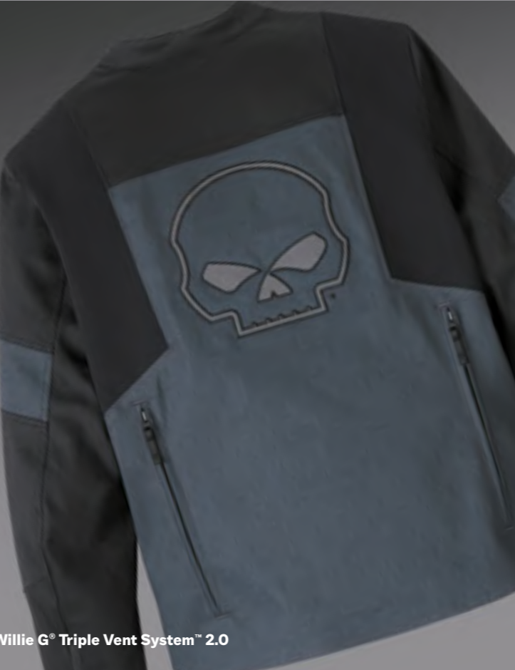
Willie G® Triple Vent System™ 2.0