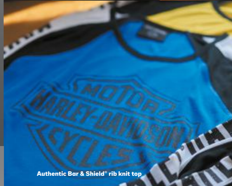
Authentic Bar & Shield® rib knit top