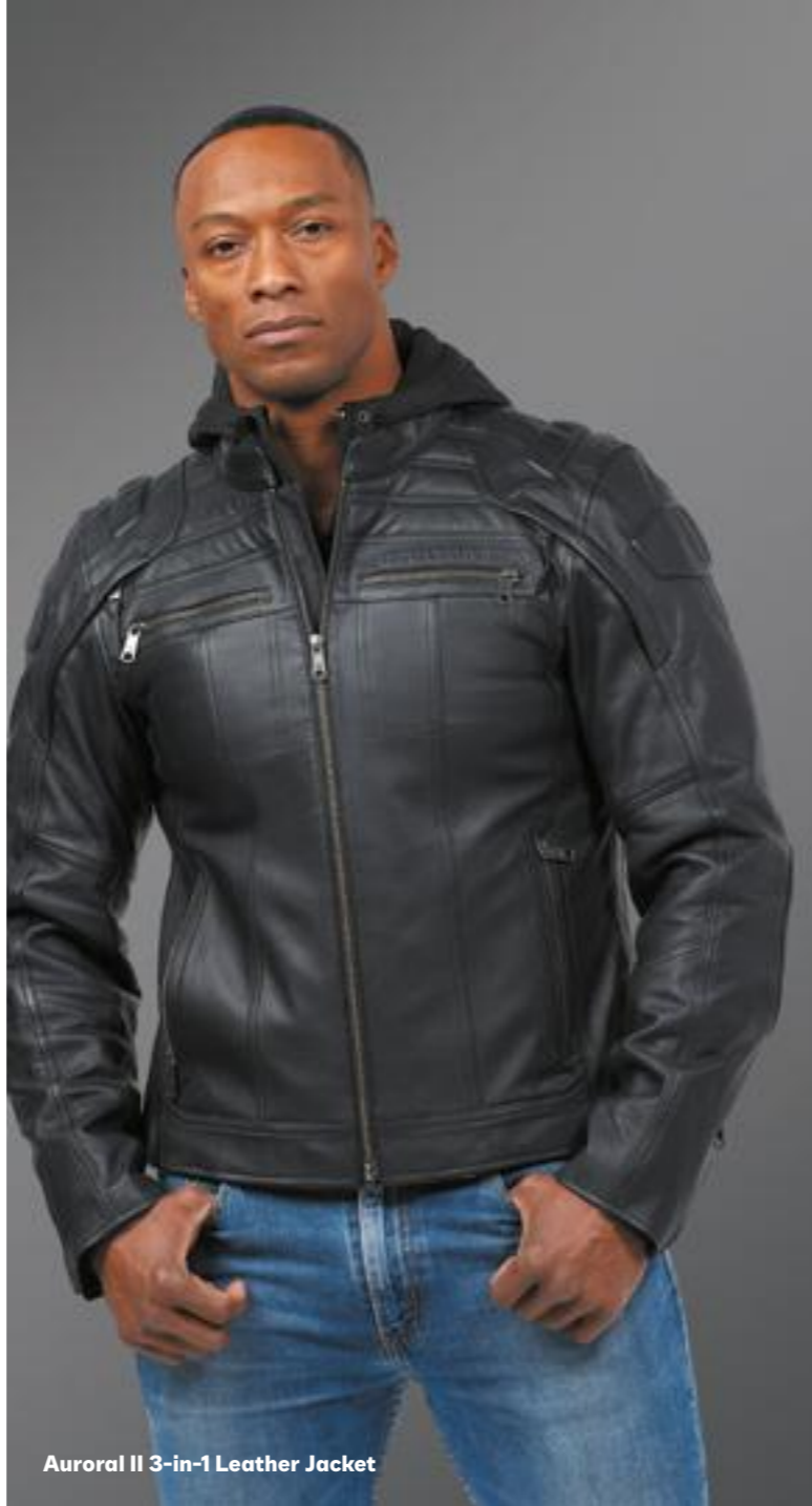
Auroral II 3-in-1 Leather Jacket

We don't ease off the brakes when it comes to H-D® apparel and riding gear design. Every jacket, riding trousers, gloves, T-shirt, work shirt, helmet and more are designed to be functional, stylish and worthy of carrying the Bar and Shield®. From the first touch and smell of leather to the exacting, comfortable first fit of a hoodie, the quality is obvious.