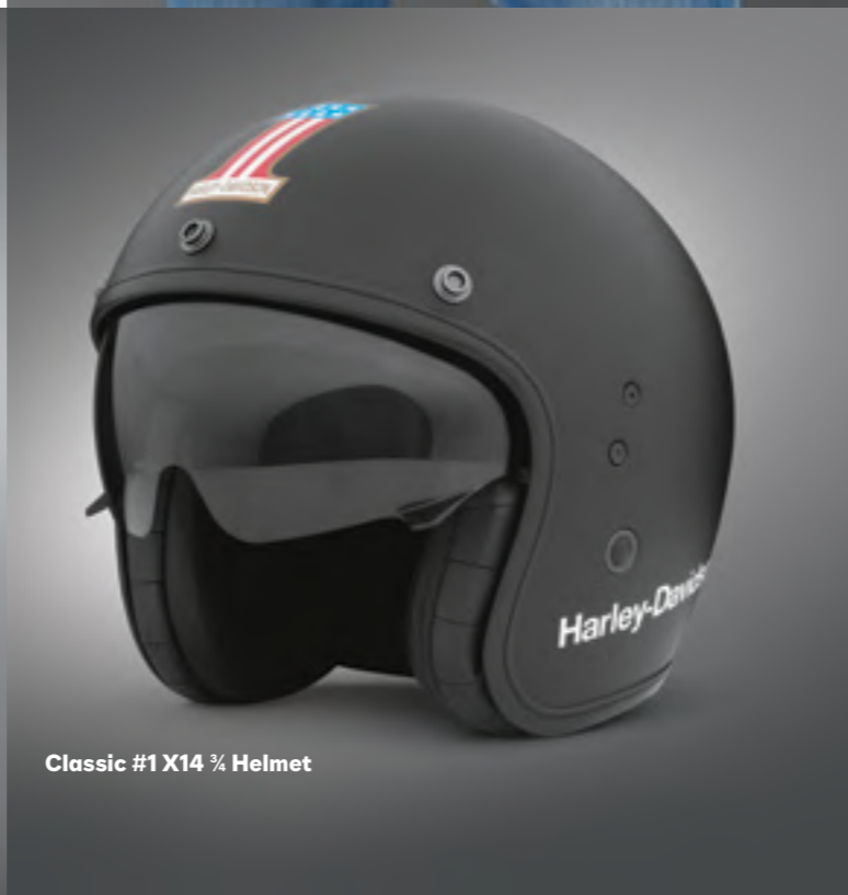
Classic #1 X14 ¾ Helmet