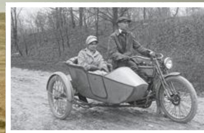
Early 20th century touring – The bike is a 1915 model 11F rigged with electrical lamps and the sidecar is a model 11-L right hand sidecar